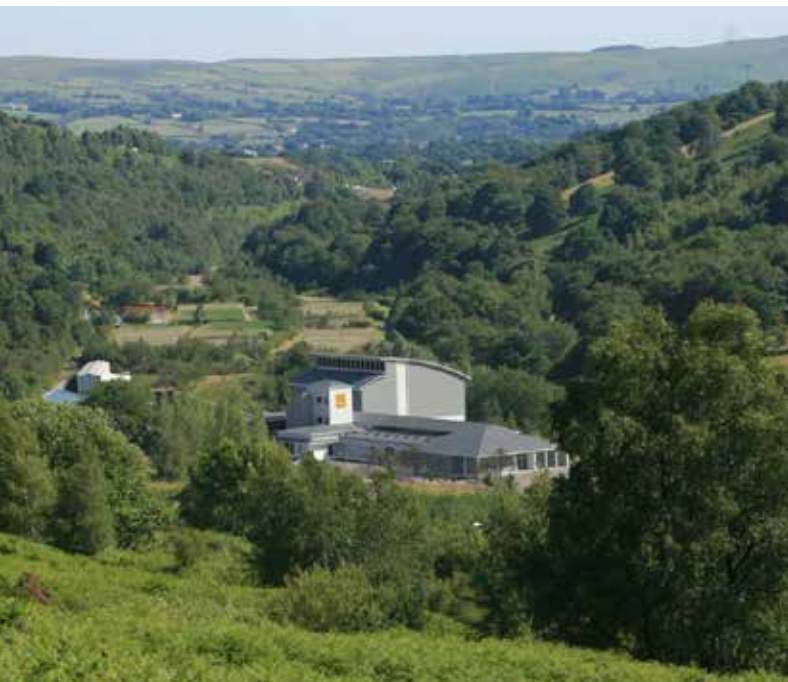
CGI IMPRESSION OF REFURNISHED CENTRE